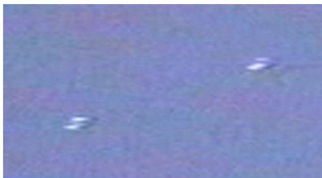
The first and the second object pass very near each other.