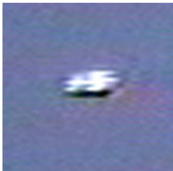
Close up of the first object caught on the 1993 Arvada video.