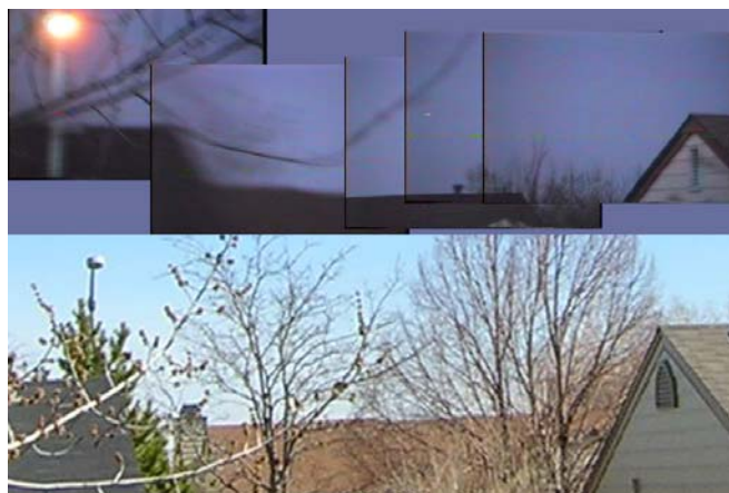
The Upper picture is a compilation of the skyline in the video. The bottom shows that same view today.